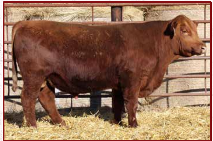
G59 is a really nice bull that has some gut capacity to him.

BECKTON JULIAN GG B571 RED HILL B571 JULIAN 84S BECKTON BARMAID M554 CH RSJR 72C JEB 570 DESIGN 787 BBBB 787 BBRED 7270 BBBB 8 BBRED 6344 OCC NO DOUBT 622N GOURLEY NO DOUBT 917 SIXE MS LOGAN 109 BRUNS R112-5023 CKRA HIGH MARK 318 FEDDES LAKINA R112 FEDDES LAKINA 348