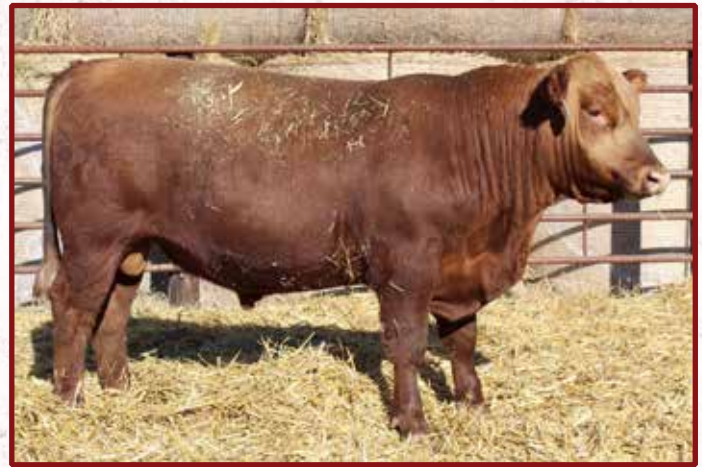
Smooth made long bull with a wide top.

BECKTON JULIAN GG B571 RED HILL B571 JULIAN 84S BECKTON BARMAID M554 CH CALVO 84S MR SANDMAN 78A PBC SX CHF 0842 PANHANDLE ASTER 368 LFRA VERA L317 5L DOUBLE BLAZE 1134-8576 5L DOUBLE BLAZE 2279-188Z 5L MATTIE 4236-2279 BRUNS CASEY 9134-5085 RIDGE THUNDER 709 RIDGE CASEY 4106-9134 RIDGE CASEY 004-4106