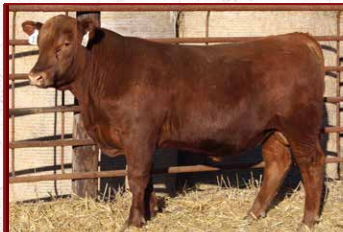
G24's dam is a tremendous OCC No Doubt daughter. A larger framed bull that will be a good one.

BECKTON JULIAN GG B571 RED HILL B571 JULIAN 84S BECKTON BARMAID M554 CH CALVO 84S MR SANDMAN 78A PBC SX CHF 0842 PANHANDLE ASTER 368 LFRA VERA L317 PCC COLORADO HOBO OCC NO DOUBT 622N OCC VANESSA 601L GOURLEY ND M80-915 LCHMN GRANDCANYON 1244G LSF COUNTESS M80 LSF COUNTESS J1373