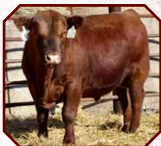
This big chested, thick made bull is in the top 5% for Herd Builder and Stayability. G71's daughters will not only be the low maintenance kind of cows that you're looking for, but they will stay in your herd longer.