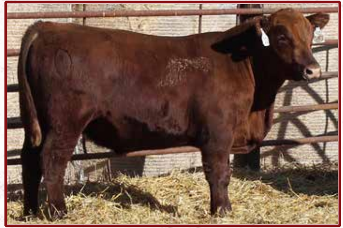
G83 Mr. Sandman crossed with a cow packed with Canadian genetics. Top 3% HB, Top 6% ME and STAY.

BECKTON JULIAN GG B571 RED HILL B571 JULIAN 84S BECKTON BARMAID M554 CH CALVO 84S MR SANDMAN 78A PBC SX CHF 0842 PANHANDLE ASTER 368 LFRA VERA L317 MLK CRK CUB 722 RED CROWFOOT OLE'S OSCAR RED CROWFOOT OMEGA 9179J RIDGE ROSE 5209-766 RED CROWFOOT CHIEF 1079L RIDGE ROSE 688-5209 OTT-750-688