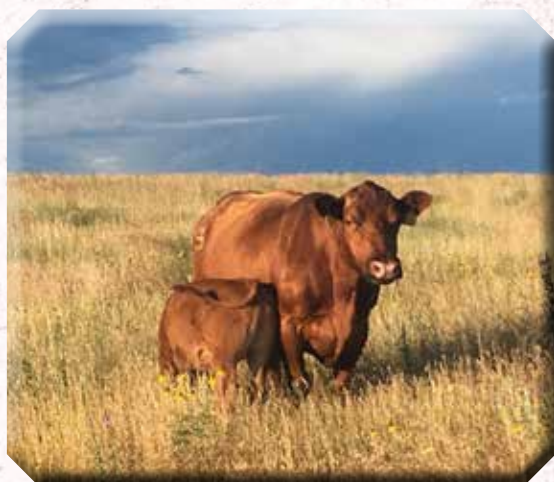
Double bred 84S with a splash of 5L Tradesman makes for a great cow maker.