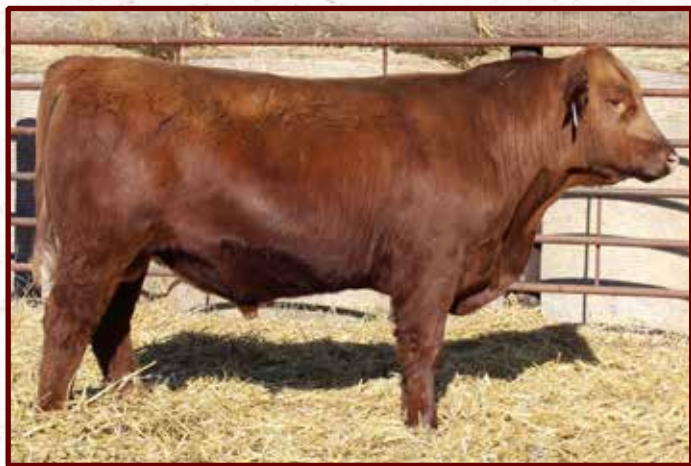
Clean chested X Factor son.