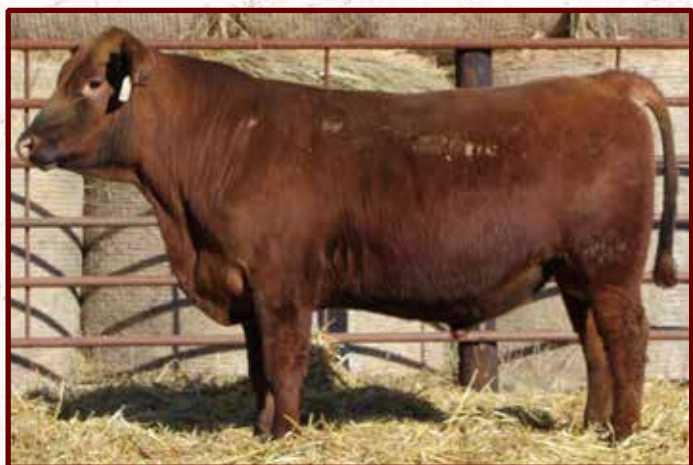
G15 is one long bodied smooth made bull.