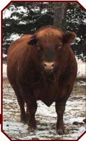
Calvo 84S Mr. Sandman 78A