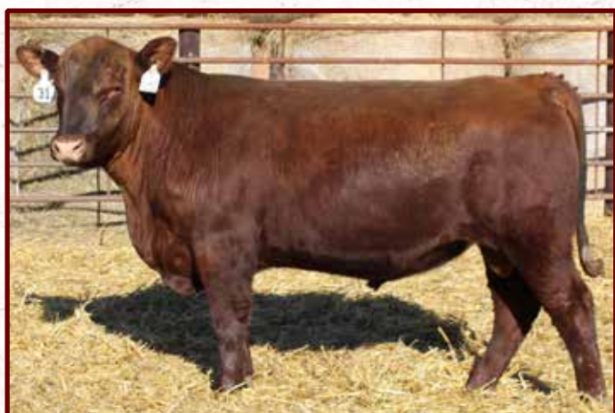
G41's dam just finally left the ranch because of injury. She was 12 years old with a shape to her and a long body.