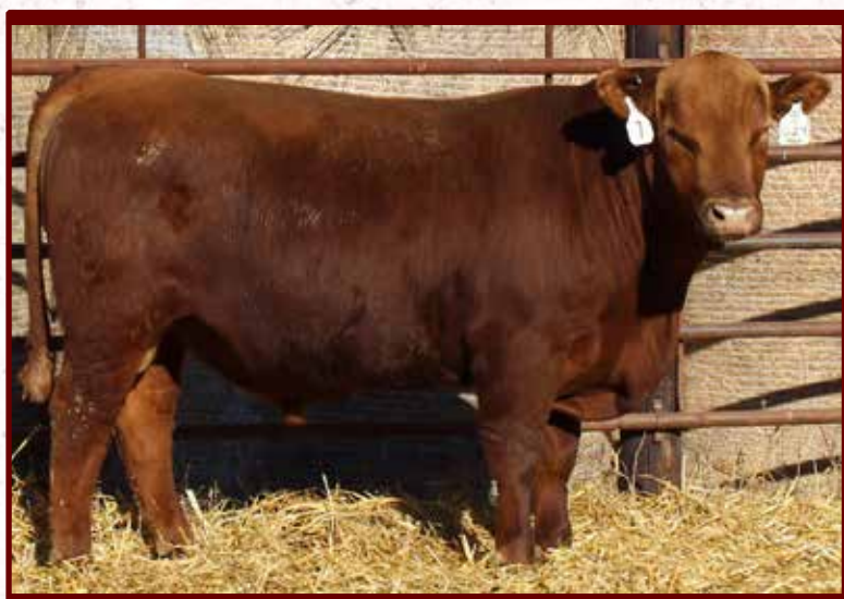
This awesome bull is what you get when you breed one of the best 84S sons ever made with one of the best 5L Tradesman daughters ever made... Mr. Sandman G29.