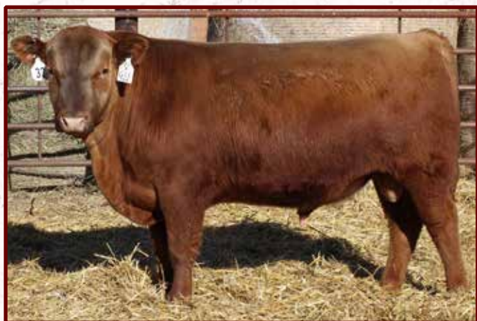
G11's dam is an exciting young cow for us. Her dam is the mother to lot 8. Nice long, smooth made bull here.