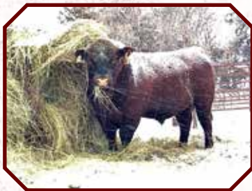
Mushrush Magnum D507