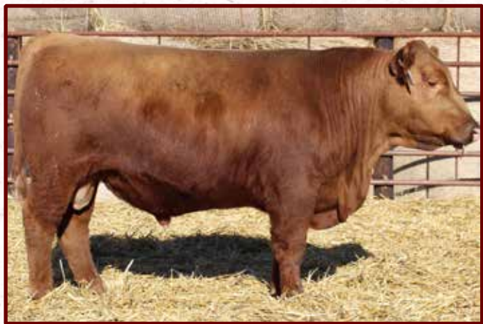
Long hiped, easy fleshing X Factor son. X Factor daughters are already proving to be some of our favorites. Red Sky 7046 has such a strong maternal pedigree.