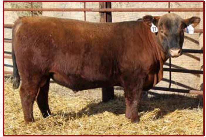
Deep bodied, nice hip.

BECKTON JULIAN GG B571 RED HILL B571 JULIAN 84S BECKTON BARMAID M554 CH CALVO 84S MR SANDMAN 78A PBC SX CHF 0842 PANHANDLE ASTER 368 LFRA VERA L317 PCC JOHNNY B GOOD 4003R PCC JOHNNY COME LATELY 4090X PCC MISS ANCHORAGE 0132 BRUNS KATYA 220-5099 GOURLEY NO DOUBT 917 BRUNS KATYA 5399-220 5L KATYA 2647-5399