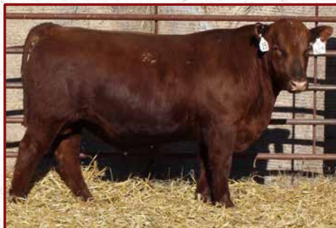
Massive hip on this Mr. Sandman son. Top 6% HB, top 4% ME and STAY.

BECKTON JULIAN GG B571 RED HILL B571 JULIAN 84S BECKTON BARMAID M554 CH CALVO 84S MR SANDMAN 78A PBC SX CHF 0842 PANHANDLE ASTER 368 LFRA VERA L317 RED HILL B571 JULIAN 84S BUF CRK JUBILEE W008 BUF CRK ANASCO T045 BRUNS ROSE 628-2021 RED CROWFOOT OLE'S OSCAR RIDGE ROSE 430-628 RIDGE ROSE 256-430