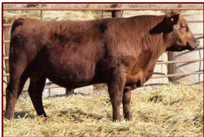
Top 1% ME. Easy fleshing smaller framed bull with an excellent disposition. Commercial bull sired by a Johnny Come Lately son.